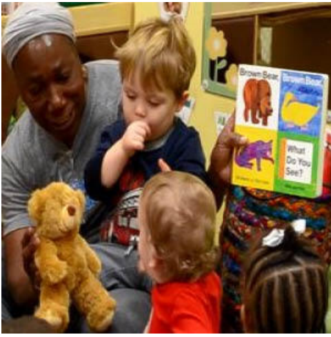
Baby Artsplay - aa