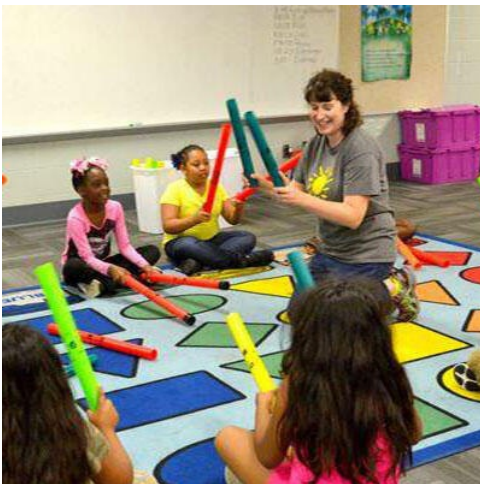
Creating a Music Soundscape - playing percussion instruments using improvisation