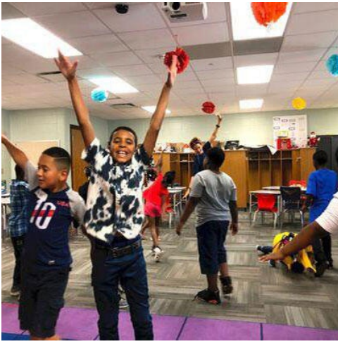
Theater - Dance